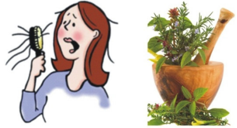
Herbal Formulation for hair care